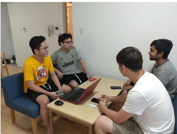
In the Unit